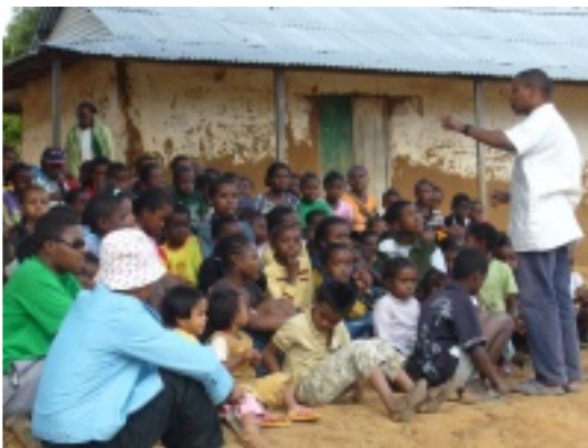
Teaching the children at the holiday club