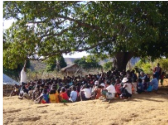
Under the mango tree